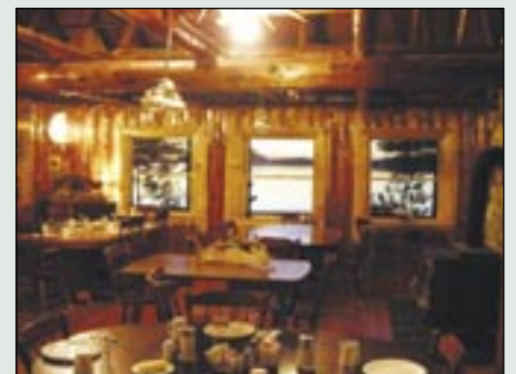
New dining room.

We are completing the project and it will soon be ready to go to the printers. This version is a hardcover 3 ring binder style and will tempt