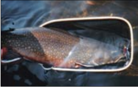
Kepimets 9 pounder.

B ig fish and lots of them was how we started out at Riverkeep. The water dropped earlier than normal, but the pike and other fish really made up for the slower than normal brook trout late in the season. Our largest brook trout was taken from the Kepimets River inlet which topped 10 pounds . The season